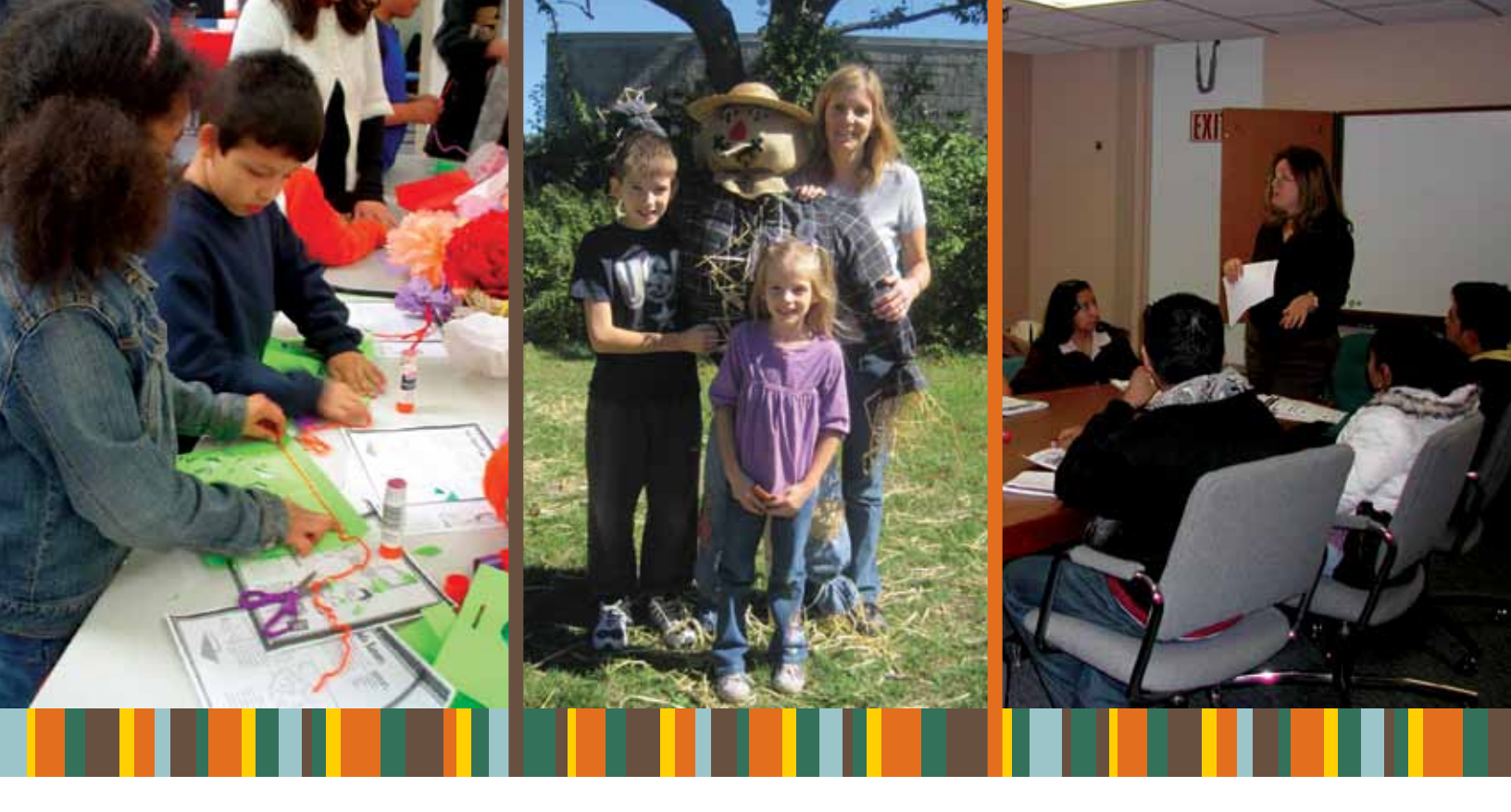
Left: Children create papel picado banners as part of the Day of the Child/Day of the Book festival. Middle: A family participates in a scarecrow-making program in the library's courtyard. Right: ESOL classes at the library.