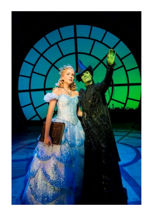
<u>This Photo</u> by Unknown Author is licensed under <u>CC BY-NC-ND</u>