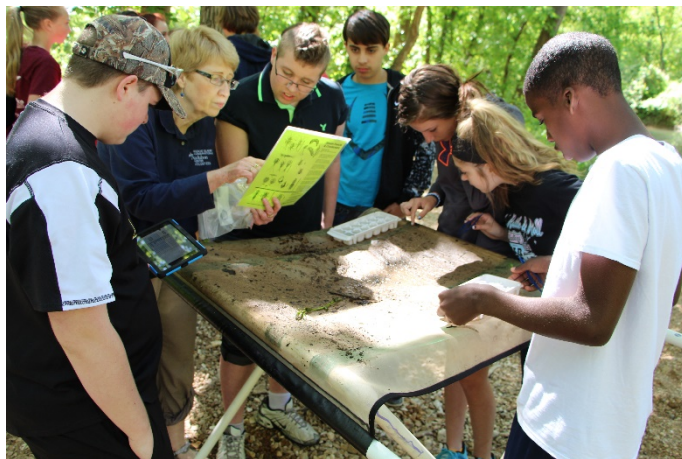
Figure 2 Students identify macroinvertebrates they collect from Shoal Creek in order to create a water quality rating score based on their sensitivity to pollution.

organization has an interest in implementing best environmental education (EE) practices and sharing successes with other conservation-oriented institutions in order to help create a more environmentally literate population. As experts in both environmental education and Geographic Information System (GIS) applications, our aim is to break down this technology barrier by creating a simple, replicable process for incorporating GIS-based activities into nature center programming. This pilot project was executed at the Wildcat Glades Conservation & Audubon