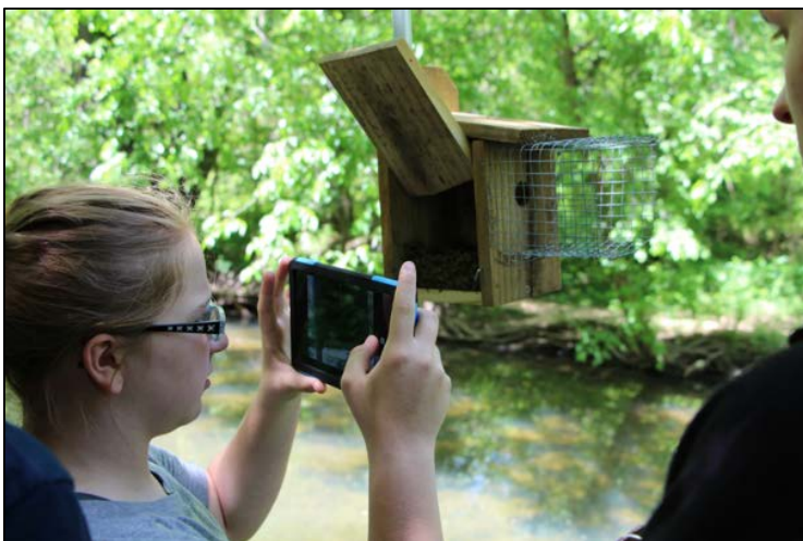
Figure 1 Using the Collector app on tablet to gather nest box data

Our project, entitled “Integrating Mapping into Environmental Education Programs,” recognizes the lack of use of technology in non-formal education programs offered by nature centers, as well as museums and other interpretive sites, as a universal problem for these providers. There are currently 41 nature centers within the Audubon network, so the