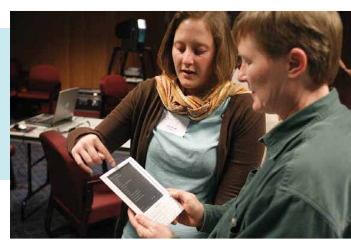
A staff member from the Humboldt County, CA Library teaches a member of the public to use an e-book reader.

The complete IMLS Strategic Plan is available at www.imls.gov/plan.