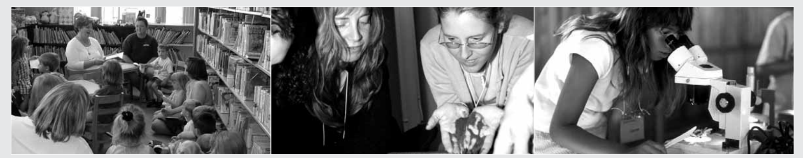
Fulton County Summer Reading Program (Kentucky Department for Libraries and Archives School and Public Library Partnership Programs)

Discipline-based Partnerships Discipline-based partnerships enable museums and libraries to use their expertise to help strengthen K-12 teaching in specific content areas. Although the examples below focus on science, museums and libraries representing other disciplines, such as history and art, are involved in similar collaborations. In many disciplines, museums and libraries have developed programs that help students meet state and national reading and writing standards. In the arts, for example, research has shown that studying the arts helps to improvement achievement in other subjects, including reading, writing, and mathematics. In places like science