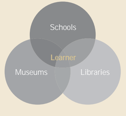
Figure 1: A New Model for Learning.

In this vision, museums, libraries, and schools are core hubs of the learning society.