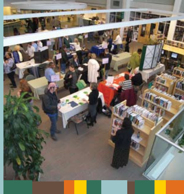
Left: Adults enhance their job skills at the library's free computer classes. Middle: Kids' early literacy skills improve when they read to their canine friends through the library's Pups & Pages programs. Right: At the annual Opportunities Job Fair, job seekers and employers meet face-to-face, hoping to make the perfect match.

gramming it has spurred—is a promise that the library will remain a constant in Stark County, there to help the community recover and ultimately flourish.