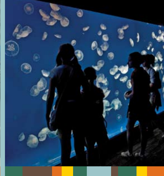
Left: The aquarium's eco-tour boat, the River Gorge Explorer, in front of one of the aquarium buildings. Middle: An aquarium staff member shows a shark jaw to Tennessee Aquarium summer campers. Right: The aquarium's Jellies: Living Art gallery

on hard times and was a shell of its former vibrant self. Since then, the aquarium has established itself as a leader in its community, helping to revitalize its city and demonstrating a sustainable, long-term contribution to the ecological well-being of the community and the education of those who live in the region.