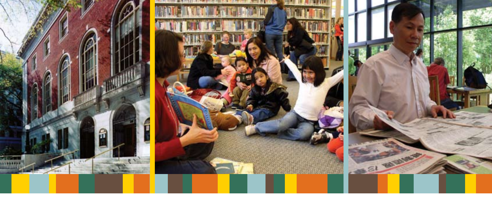
Left: The Central Library is located in downtown Portland and is on the National Register of Historic Places. Middle: Spanish language storytime is a popular Multnomah County Library program, photo by Kristin Beadle. Right: The library's collection features newspapers in various languages, photo by Kristin Beadle.