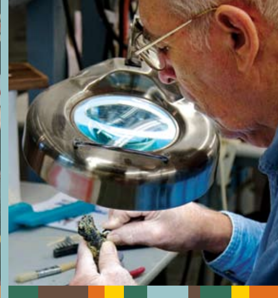
Left: The Center welcomes more than 2,000 people for a viewing of the 2009 presidential inauguration. Middle: Hands-on activities during the annual Passport to the World series of culture festivals, Right: A volunteer in the Center's "Paleo Lab" engages in active research

interaction and learning; a place where exhibits and programs converge for the enjoyment and education of its millions of visitors each year.