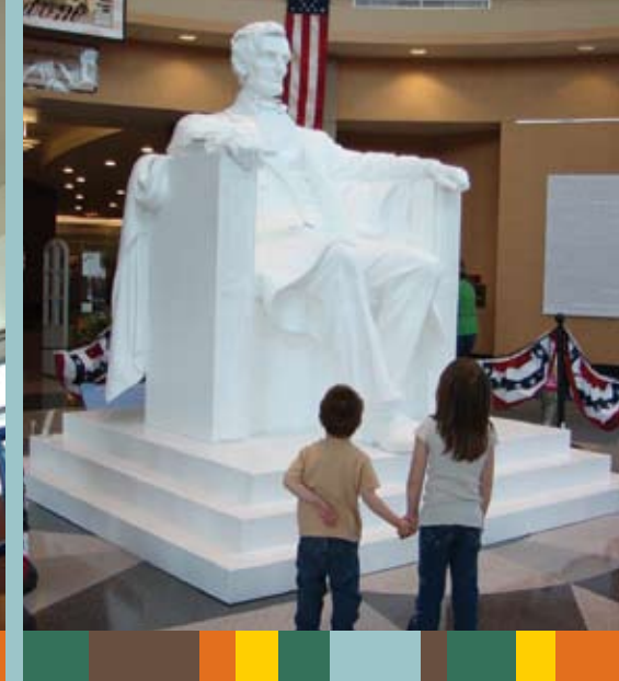
Left: A young visitor asks a question during a live conversation with Clay Anderson, an astronaut aboard the International Space Station; photo courtesy of the Courier News. Middle: Installation of the GIANTS: African Dinosaurs exhibit. Right: Young visitors view an exhibit on display as part of the Tapestry of Freedom program.