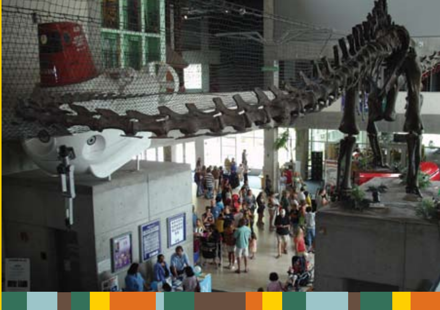
Left: MOSI offers a wide array of enrichment programs and classes for students. Right: Inside the MOSI entryway.